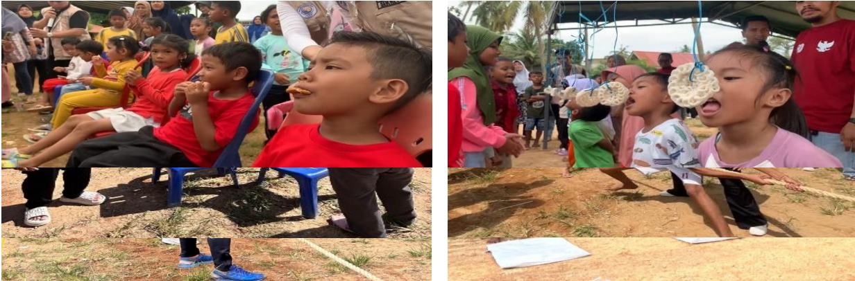
Figure 1. Competition Implementation

Ultimately, the festival successfully created interaction spaces that brought together residents from diverse backgrounds. This is particularly important given the heterogeneity of the Panau Village community, which often leads to social distance. Through the festival, intensive interactions were fostered, cultivating a sense of kinship (Fukuyama, 1999). These findings confirm that collective activities based on community participation can serve as an effective instrument to strengthen social solidarity and community cohesion (Pretty, 1995). Overall, there were three main achievements from this activity. First, increased community participation in collective activities. Second, the creation of social interaction spaces that reinforced solidarity and kinship. Third, the involvement of sponsors and microeconomic participation, demonstrating multi-stakeholder collaboration. These outcomes align with the initial objectives of the program, namely to provide a platform that fosters solidarity, kinship, and the spirit of independence in Panau Village.