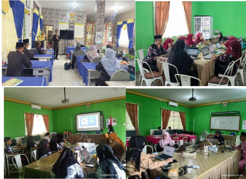
Figure 2. Documentation of the PKM Activity "Improving Basic English Skills for Elementary School Teachers in Sekupang District"

The implementation of Community Service (PKM) activities with the theme "Improving Basic English Language Skills for Elementary School Teachers in Sekupang District" aims to provide training and provision to elementary school teachers so that they are able to use English in a basic way in learning activities. (Freeman, 2017; Pajarwati et al., 2021). The training was conducted through interactive lectures, simple communication practice exercises, and the use of digital learning media. Before the training began, participants were given a pre-test to assess their initial abilities, and after the training, a post-test was administered to assess learning outcomes. (Sitoresmi et al., 2024).